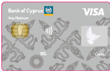
Visa Platinum Credit