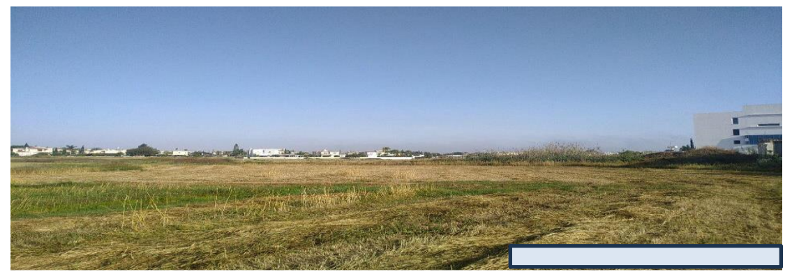
BANK OF CYPRUS PUBLIC COMPANY LTD (BOC) has made every reasonable effort to confirm and / or verify the information in this document. It is noted, however, that (a) this information was obtained from public records and / or third parties without the possibility of confirming their accuracy; and (b) BOC neither has possession nor is the owner of the property for sale, therefore the details in this document are provided solely for information purposes, without assuming any responsibility and / or duty and / or obligation by BOC to any person who may become aware of them. BOC strongly urges and / or strongly suggests that, with the help of specialized consultants of their choice, any Interested Buyers, conducts their own investigations and / or on-site examination of the property for sale, in order to verify and / or obtain personal knowledge of all information and data that may affect the decision to participate in the upcoming auction of the property for sale.